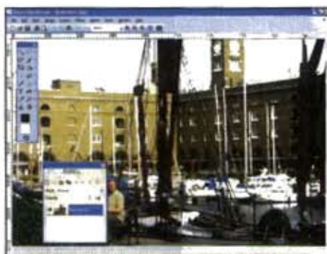
PhotoRestyle is a version of Ability Photopaint, so it complements Complete Office very well.

The presentation package creates slide-shows containing pictures and graphics for use in business and educational presentations. It can open files from Microsoft PowerPoint and save them in both PowerPoint and PDF formats. It's easy to use and includes a wide range of transitional effects between slides. The database isn't quite a clone of Microsoft Access, but it's close. Most users will have no use for it because basic list-making and record-keeping is easier to do in the spreadsheet, but it's a powerful tool for anyone who has database experience. The least significant module is a picture manager called PhotoAlbum, which is used to view, organise and print pictures downloaded from