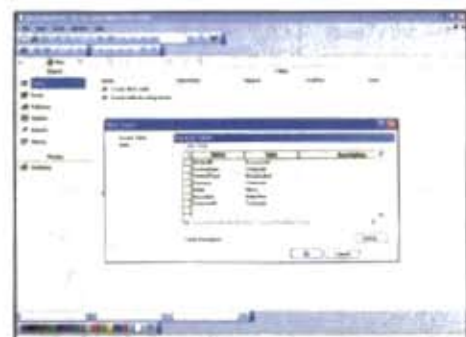
The database isn't quite a clone of Microsoft Access, but it's close.