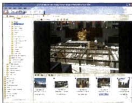
PhotoRestyle also includes a simple photo manager that lets you browse your image collection as thumbnails.